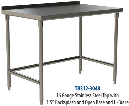
TB312-3048 16 Gauge Stainless Steel Top with 1.5" Backsplash and Open Base and U-Brace