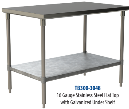
TB300-3048 16 Gauge Stainless Steel Flat Top with Galvanized Under Shelf