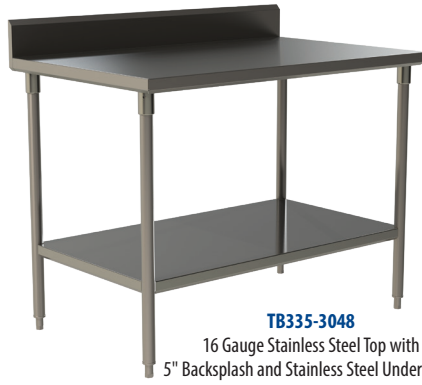
TB335-3048 16 Gauge Stainless Steel Top with 5" Backsplash and Stainless Steel Under Shelf